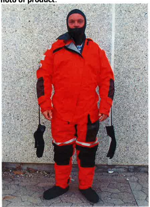
Ursuit RDS ETSO, front