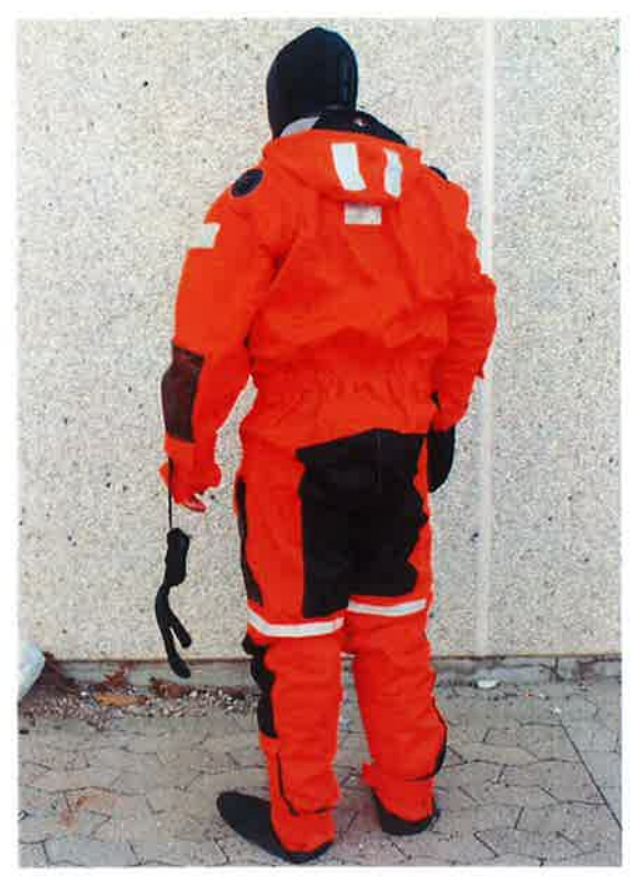
Ursuit RDS ETSO, back